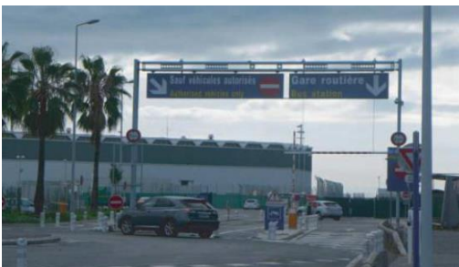
3 – Enter the restricted area "Gare Routière / Bus station".